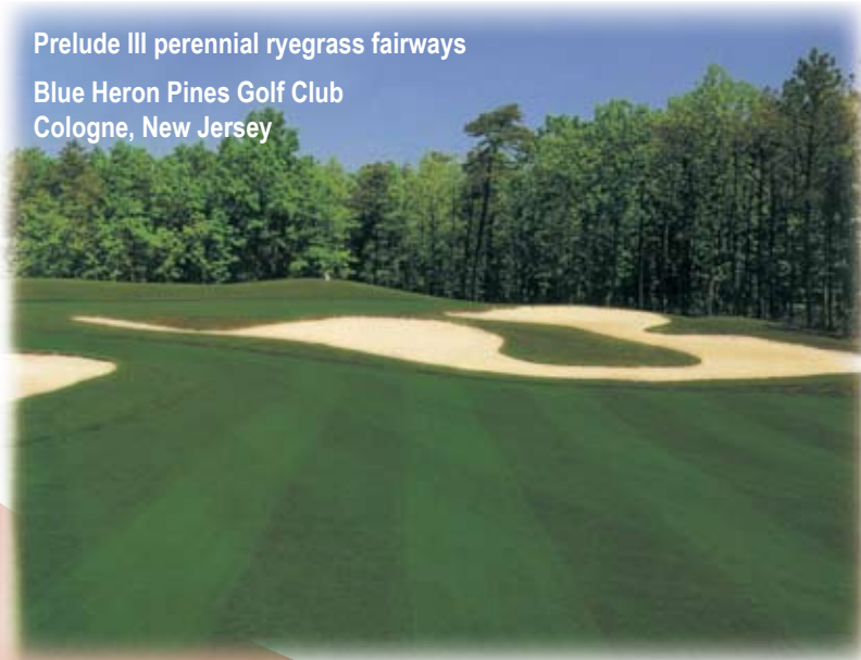
Prelude III perennial ryegrass fairways Blue Heron Pines Golf Club Cologne, New Jersey

The dark green color and desirable leaf density of Prelude III make it a popular choice for golf course superintendents. It's intended for golf course greens, tees, and fairways in cool season climates and winter overseeding in the southern states. It exhibits a slower and lower growth for a cleaner cut and good winter hardiness. Prelude III is extremely wear tolerant and is endophyte enhanced for natural insect resistance. This versatile grass is great for golf course use by itself or in a blend.